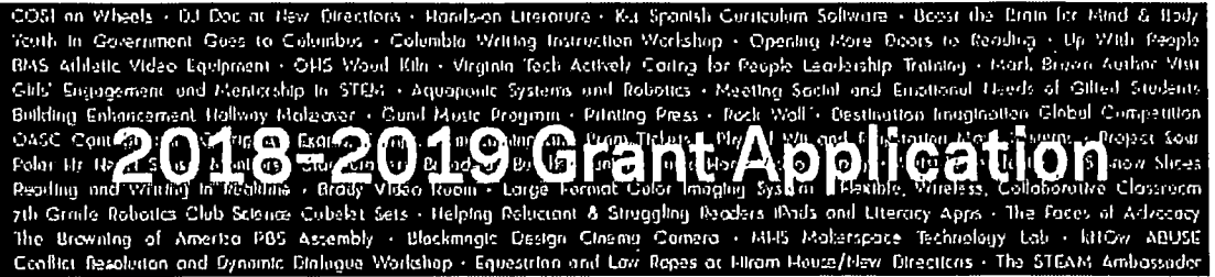
EXHIBIT A PAGE 1 OF 5