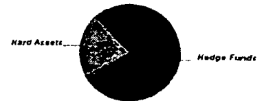
Alternative Assets as a percentage of your portfolio - 14 %