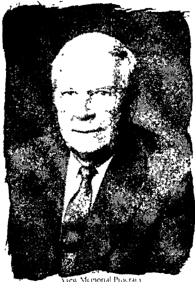
View Memorial Program

The Donahue Foundation is a private foundation that was established in Colorado in 1990. The main objective of the Foundation is to help provide tuition assistance to the young and economically disadvantaged. Specifically, the Foundation expresses special interest in Catholic and other non-public schools. By working with the schools, the Foundation hopes to increase the amount of financial assistance available to needy students.