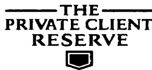
Exhibit 2 00-F-A -H-OH -004-01 00294701 2947 0144575-00-00711-01 Page 29 of 30 ACCOUNT NUMBER: 00001119300 FAYE MCBEATH FOUNDATION

This statement is for the period from January 1, 2013 to December 31, 2013