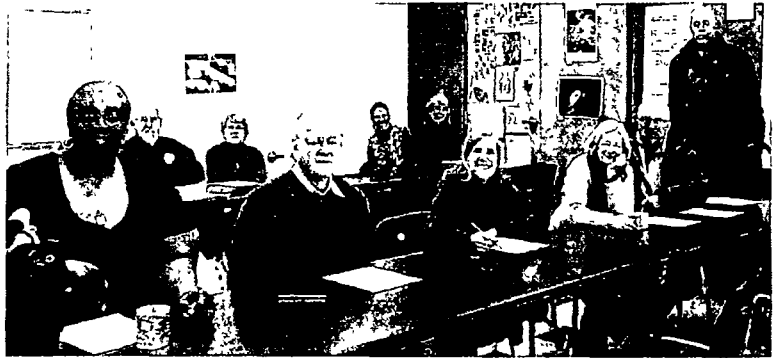
ISAAC Housing Task Force members help LISC and Housing Resources Inc. interview people at Ministry with Community every January for the HUD-required “Point In Time Count” of people who are homeless.

More Results Information about FUSE helped our County Board of Commissioners decide in October, in a 9-2 vote, to double the budget for