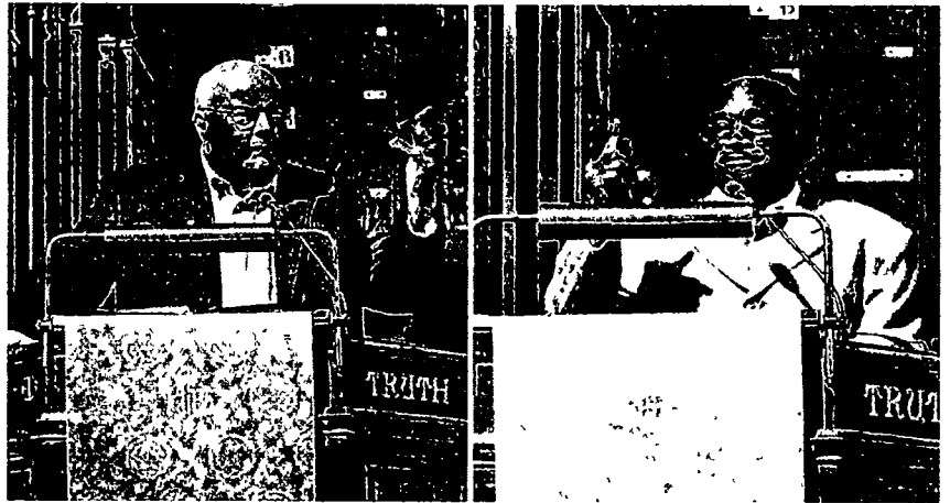
Two pastors from Flint spoke at the ISAAC Issues Convocation in October at First Congregational Church UCC about the reduction in youth violence their city has experienced because of "Ceasefire"