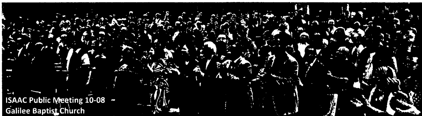
ISAAC Public Meeting 10-08 - Galilee Baptist Church

Through this process, new leaders are developed, current leaders are equipped with enhanced skills, and burned-out leaders become inspired. We use a series of leadership trainings and engage in on-going leadership development. We believe that we are the change-makers we have been waiting for.