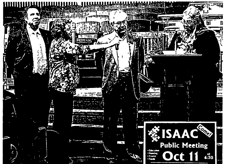
The directors of Kalamazoo Metro Transit and the County Transit Authority pledge to work together to coordinate services.

engaged over 700 residents and asked them to evaluate the current public transit system, while expressing what they'd like to see in the future.