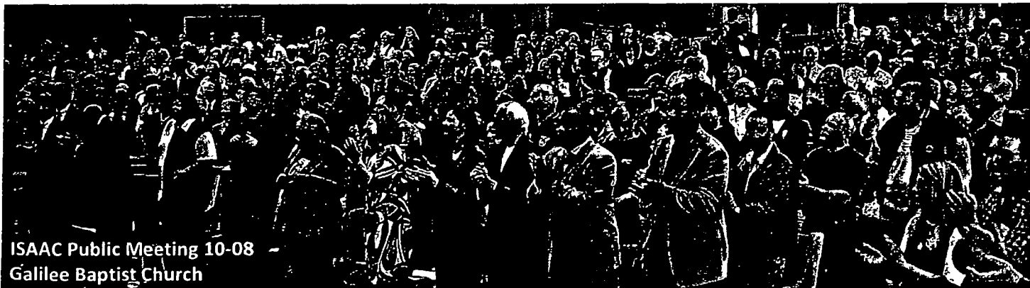
ISAAC Public Meeting 10-08 Galilee Baptist Church

Through this process, new leaders are developed, current leaders are equipped with enhanced skills, and burned-out leaders become inspired. We use a series of leadership trainings and engage in on-going leadership development. We believe that we are the change-makers we have been waiting for.