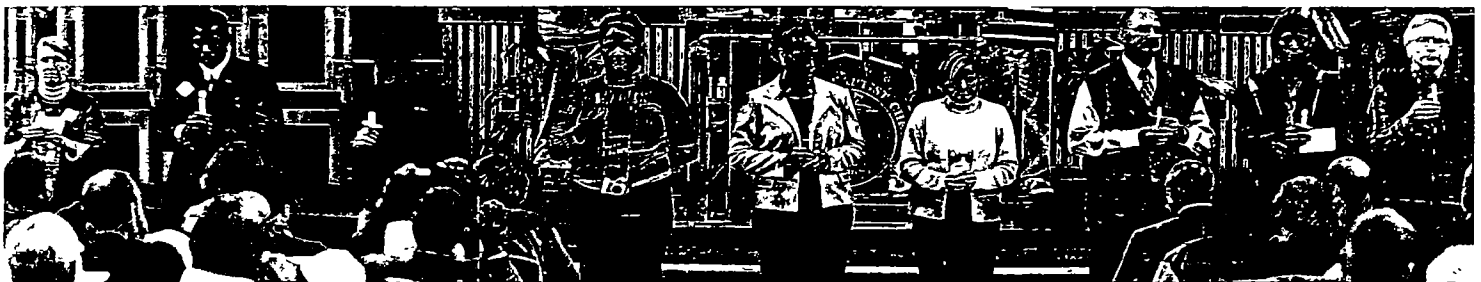
ISAAC has long been concerned with youth violence and drug addiction. This 2008 photo shows candles being snuffed out as names of young people who had been killed in violent acts were read aloud. "Ceasefire" holds the best hope for finally curbing the violence.

Join the ISAAC Youth Violence & Drug Prevention Task Force! Call 341-4213 to find out which Monday evenings we meet, 5:00-6:30, at the ISAAC office in Arcus Depot.