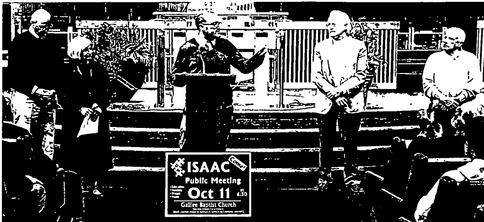
The Chamber of Commerce and the Kalamazoo Promise commit at the ISAAC 2012 Public Meeting to work on ending homelessness.

People who are working at or near minimum wage cannot afford to rent an apartment in our county, even if they are working full-time!