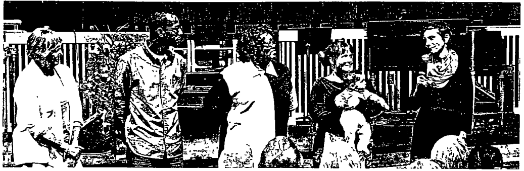
Leaders of KRESA, Trenches Church, and Great Start Collaborative pledge at the ISAAC 2012 Public Meeting to work for positive parenting education county wide.

Parenting Education, guidance and strong support, should be offered to parents. Proper support for parents, especially during crises, strengthens the resiliency of families. Links to social services and educational opportunities, facilitation of children's social and emotional development, and recognition of early warning signs of child abuse or neglect, should be in place countywide. Groups that focus on strengthening families and parenting education should be offered countywide.