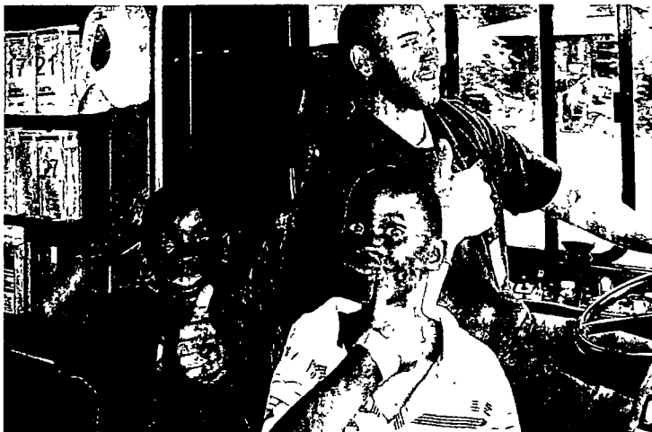
Eastside kids and bus driver enjoy the demonstration of public transportation at the "Eastside Spring Fling" in 2012.

ISAAC created and administered a survey that