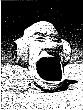
Aural Mouth sculpture at Burning Man

A Call for Submissions The Blue Rock Review, Volume 8