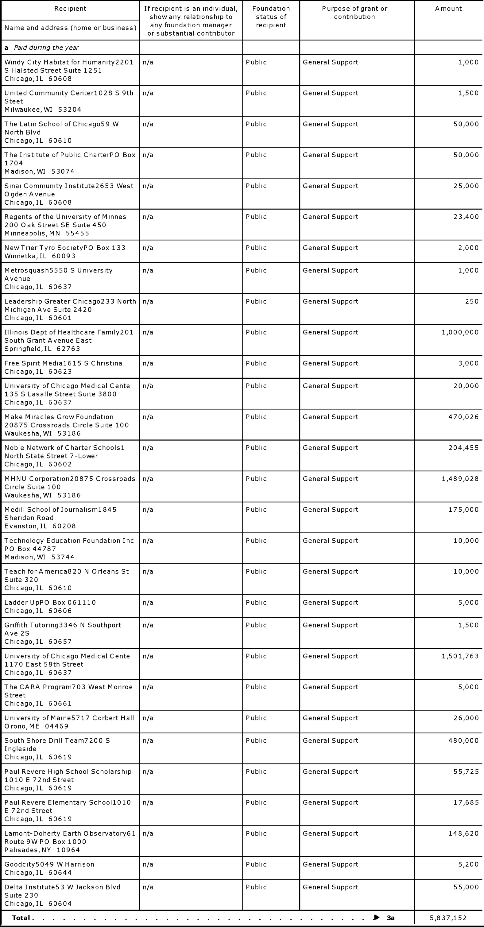
Form 990PF Part XV Line 3 - Grants and Contributions Paid During the Year or Approved for Future Payment