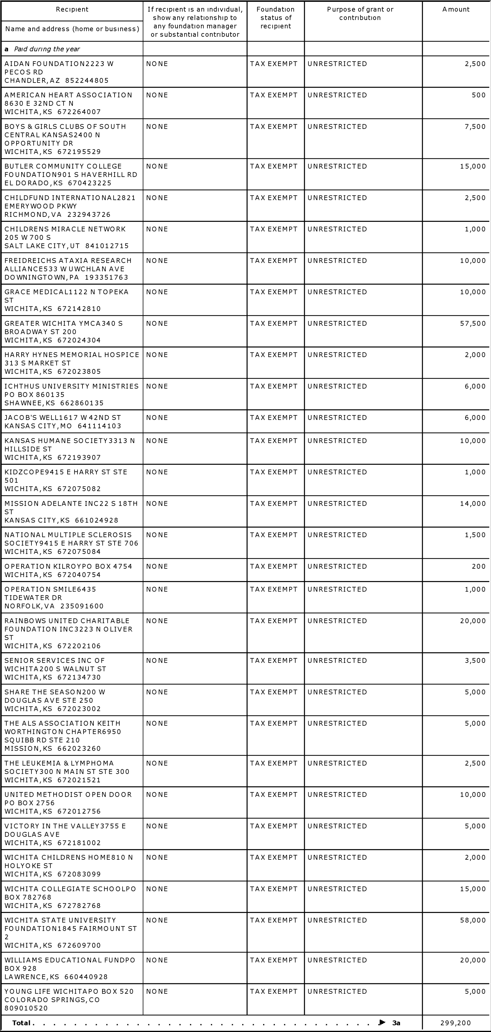
Form 990PF Part XV Line 3 - Grants and Contributions Paid During the Year or Approved for Future Payment