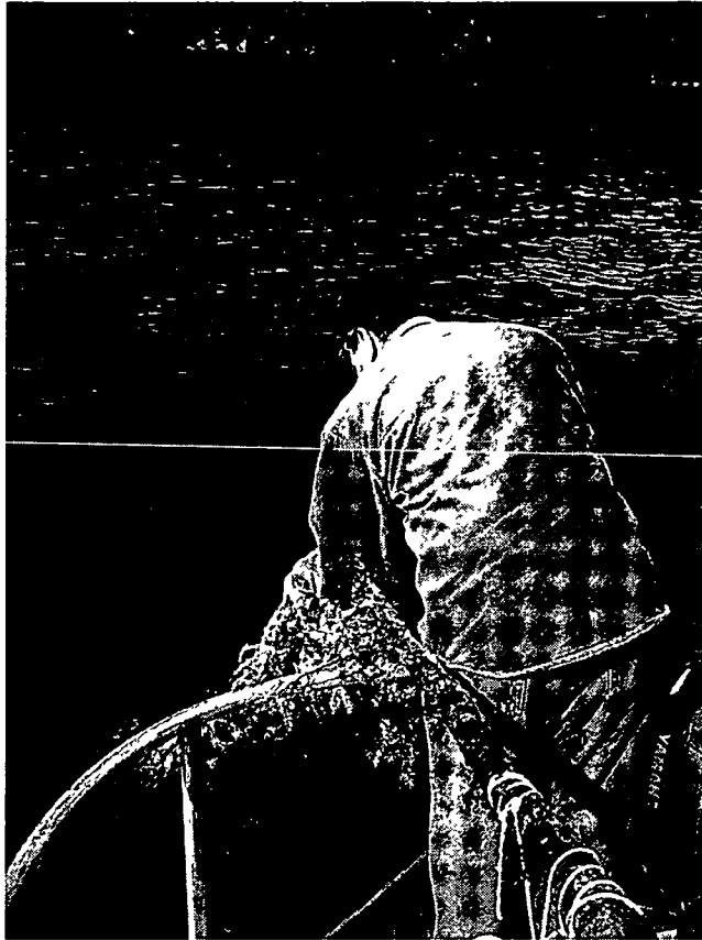
Fig. 1. Herring eggs collected on Western Hemlock branches by Tlingit leader Harvey Kitka, Sitka, AK, April 2011 He will transplant some thinly egg-laden branches to spawning areas Tlingits wish to enhance or restore