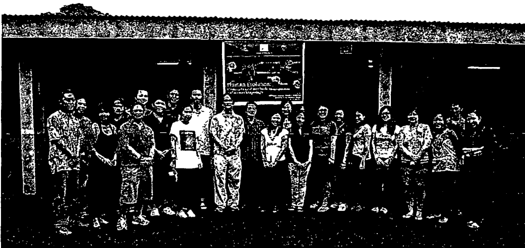
UP ASP Faculty with participants to the Palaeoanthropology Workshop