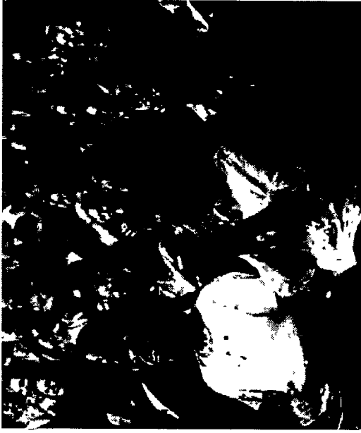
SCOTT VAN GSDOET

PLEASE NOTE: Ticket exchanges may be made within the same concert series only and are subject to availability. Performances at The Carillon and outside Austin are not included in subscription offer. All sales are final.