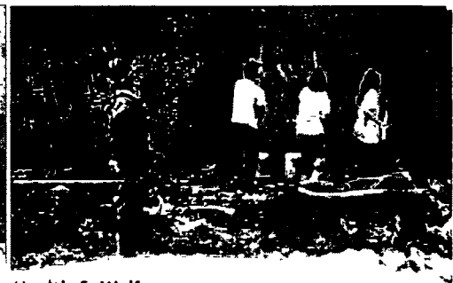
Health & Welfare