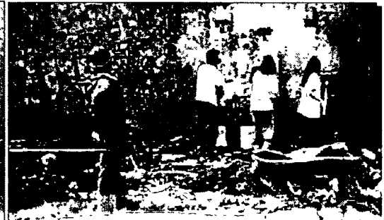
Health & Welfare