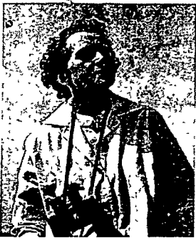
Rachel Carson