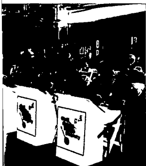
Society performed at Appreciation Night