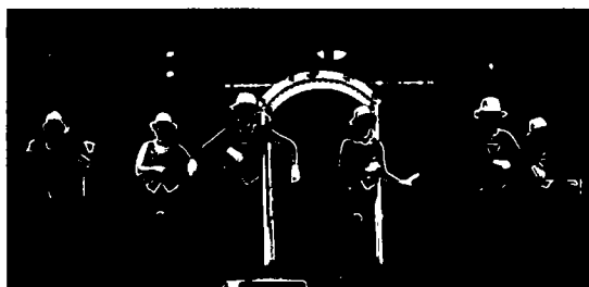
Our "Famous Vegas Show Girls" at the Royal Ride