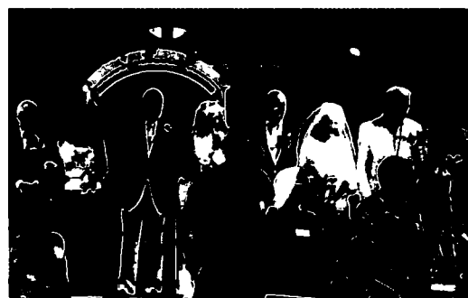
Members partaking in our "Vintage Las Vegas" wedding at the Royal Ride.