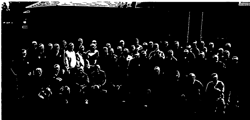
Celebrity Golf Classic 60 Celebrities from the worlds of sports, media and entertainment participated in this year's Classic