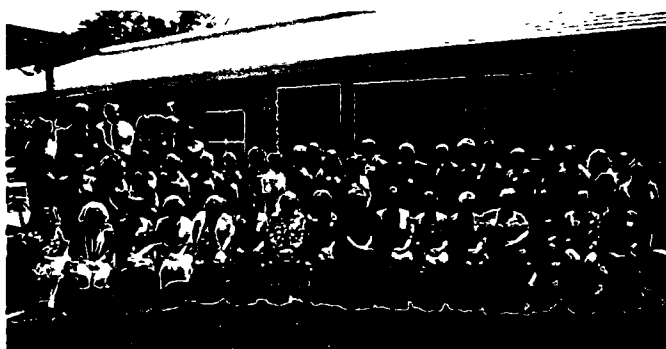
At the Grant Awards Luncheon, 38 local not-for-profit agencies received $93,600 in grants thus exceeding the $2 million milestone in aggregate grant awards