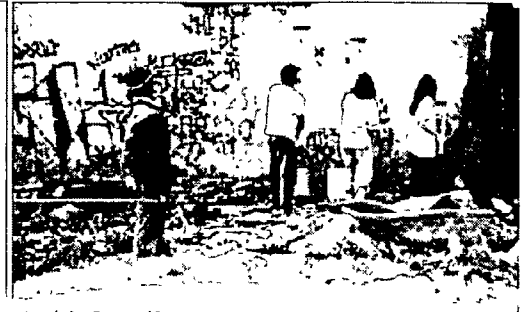
Health & Welfare

About Cathay Bank Foundation Community The Foundation