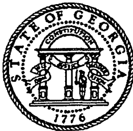
Karen C Handel Secretary of State

WITNESS my hand and official seal in the City of Atlanta and the State of Georgia on December 30, 2008