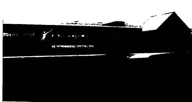
Aspirus Branch founded in 2005