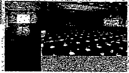
Select a conference: LNC Alumni Breakfast

For a Successful Event, Sit Back and Relax.